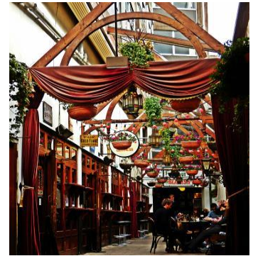
(8) Crane lane