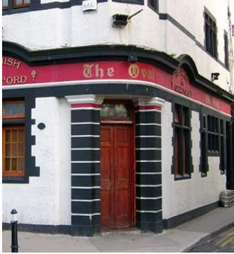
(1) The oval