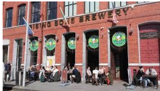
(4) Rising sons brewery