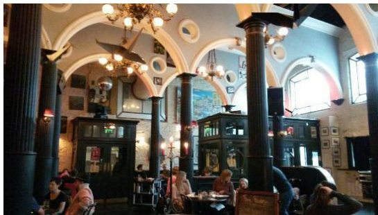
(3) The Bodega