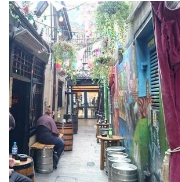
(7) Mutton lane inn