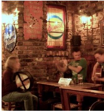
(2) An spailpin fanach