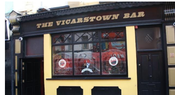
(5) The Vicarstown Bar