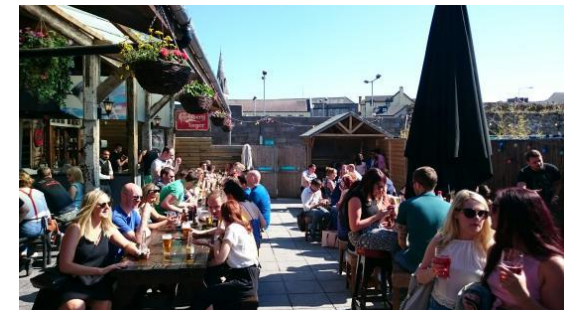
(6) Deep South